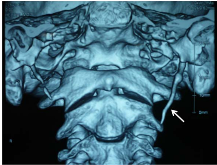
Figure 1 Elongated left styloid process (arrow). The length of left process was 44 mm, while that of the right was 25 mm.

extension. An endoscope was inserted through the mouth, and the magnified surgical field allowed identification of the small vessels and nerves and allowed the surgeon to avoid injuries. Unilateral tonsillectomy was performed first, the tonsillar bed was palpated and the tip of the styloid process was identified. The mucosa was separated longitudinally at the point of palpation of the process in the tonsillar fossa. The tissue of the parapharyngeal space was carefully separated by q-tips to avoid