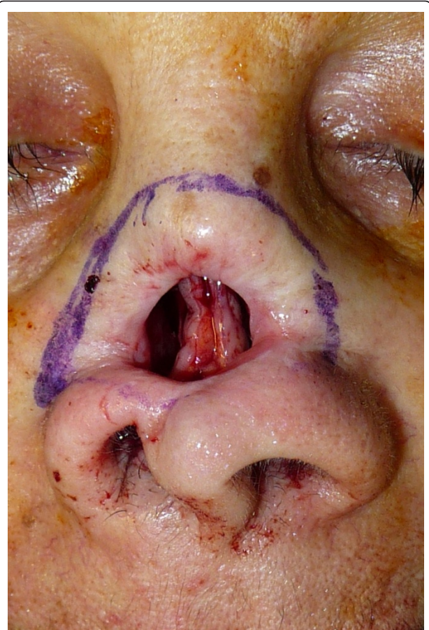
Figure 2 The cartilaginous nasal septum reconstructed using two vestibular labial mucosa flaps to recreate the mucosa.

The perichondrial cutaneous graft has very favorable peculiarities that make it usable in different types of plastic surgery, in some cases we can certainly use it even in facial plastic surgery. The auricular concha is easily accessible, has a good tissue consistency and