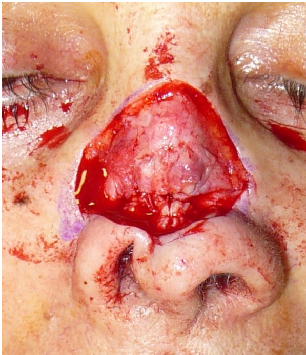
Figure 3 A view of the skin edges of the fistula turned to recreate the inner lining of the nose.