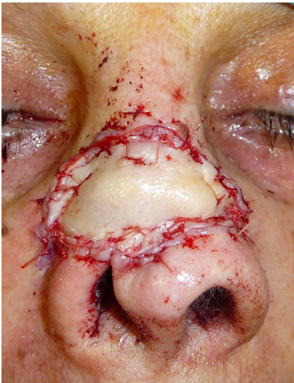
Figure 4 The surgical area covered by a graft of skin-perichondrium-cartilage removed from the auricular concha.