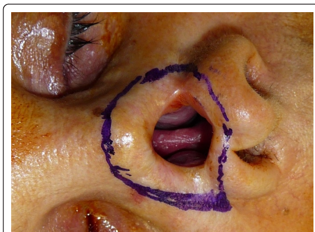
Figure 1 A preoperative image of the large defect on the dorsum of the nose.

adaptability. Useful characteristics are that it does not contract and we can see a low donor site morbidity [8]. However, the color match is not really good in colored races, so we can't suggest this graft in all patients.