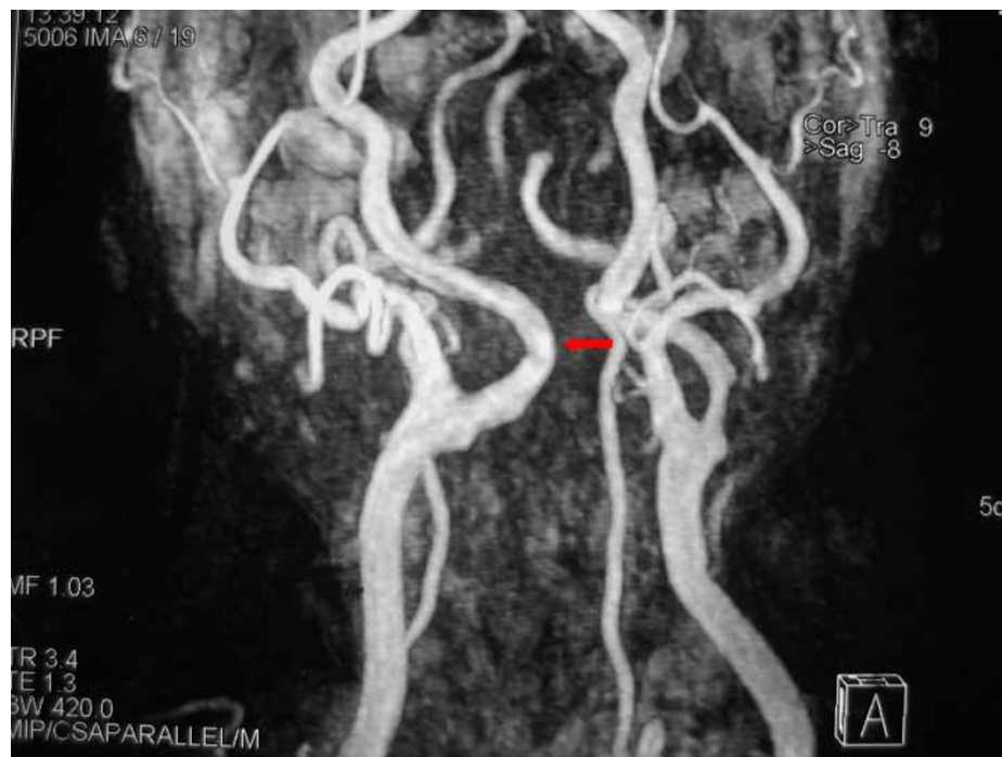
Figure 2 Magnetic Resolution Angiography after gadolinium administration shows the helicoids-ectopic course of the right ICA, immediately after the carotid bulb. Notice also, the significant stenosis of the controlateral left ICA.

shaped curve are classified as tortuosity, while any sharp bend in the vessel is classified as kinking. The causes of this malformation are atherosclerosis as observed in our patient, and congenital deformity. The mean age at diagnosis is 58 years, and the patients are usually asymptomatic.