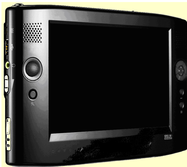
Figure 2 Ultra Mobile Computer.

The analytical apparatus can be carried in one hand and possesses a touch screen. By touching the surface of the mobile computer an exact time is registered.