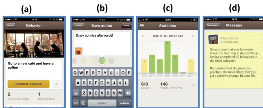
Figure 2 Screenshots of application in simulated use. (a) Choosing a behaviour from repertoire. (b) Saving a comment after carrying out a behaviour. (c) Statistics of carried-out behaviours. (d) Feedback.

This study aims to detect a moderate-sized, post-treatment between-group difference (Cohen's d = 0.5 ) with 80% power, which will require 150 participants