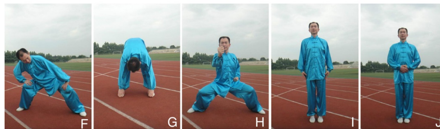
F: Sway head and buttocks to expel Heart (Xin)-fire G: Pull toes with both hands to reinforce the Kidney (Shen) and waist H: Clench fists and look with eyes wide open to enhance strength and stamina I: Rise and fall on tiptoes to dispel all diseases J: Ending posture