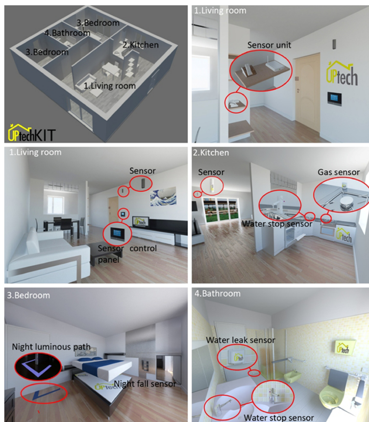
Figure 2 The design of the UP-TECH kit.

The creation of an information package for the 150 family caregivers included in the control group, illustrating the range of social and health services available in the local community, is planned. The information package will be delivered to the caregiver during home visits by the nurse. These caregivers and their families will continue to receive services in accordance with the usual care procedure, which, as already mentioned, does not include any other specific service from the health and social care systems. Some patients might receive additional care services, but