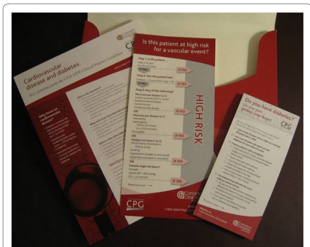
Figure 2 Contents of the Toolkit included (left to right): a synopsis of the guideline elements pertaining to cardiovascular disease risk, a laminated card with a simplified algorithm for cardiovascular risk management, and a pad of tear-off sheets for patients with a cardiovascular risk self-assessment tool.

tes that is sent quarterly to all primary care physicians in Canada. The content of this edition of the newsletter did not pertain to cardiovascular risk screening or treatment. Both the Toolkit and Canadian Diabetes were packaged together in a large mailing envelope. The control group received Canadian Diabetes alone in its usual shrink-wrap packaging, and will receive the Toolkit with the Spring 2010 edition of the newsletter.