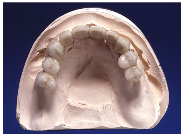
Figure 3 Example of treatment B.