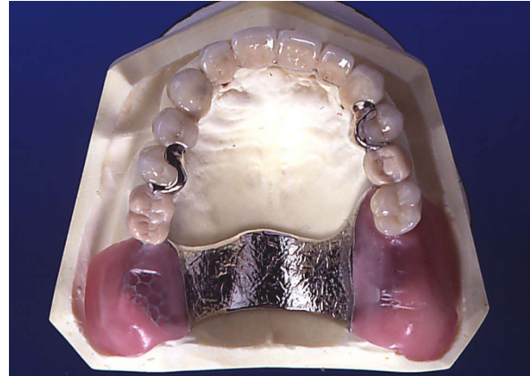
Figure 2 Example of treatment A.