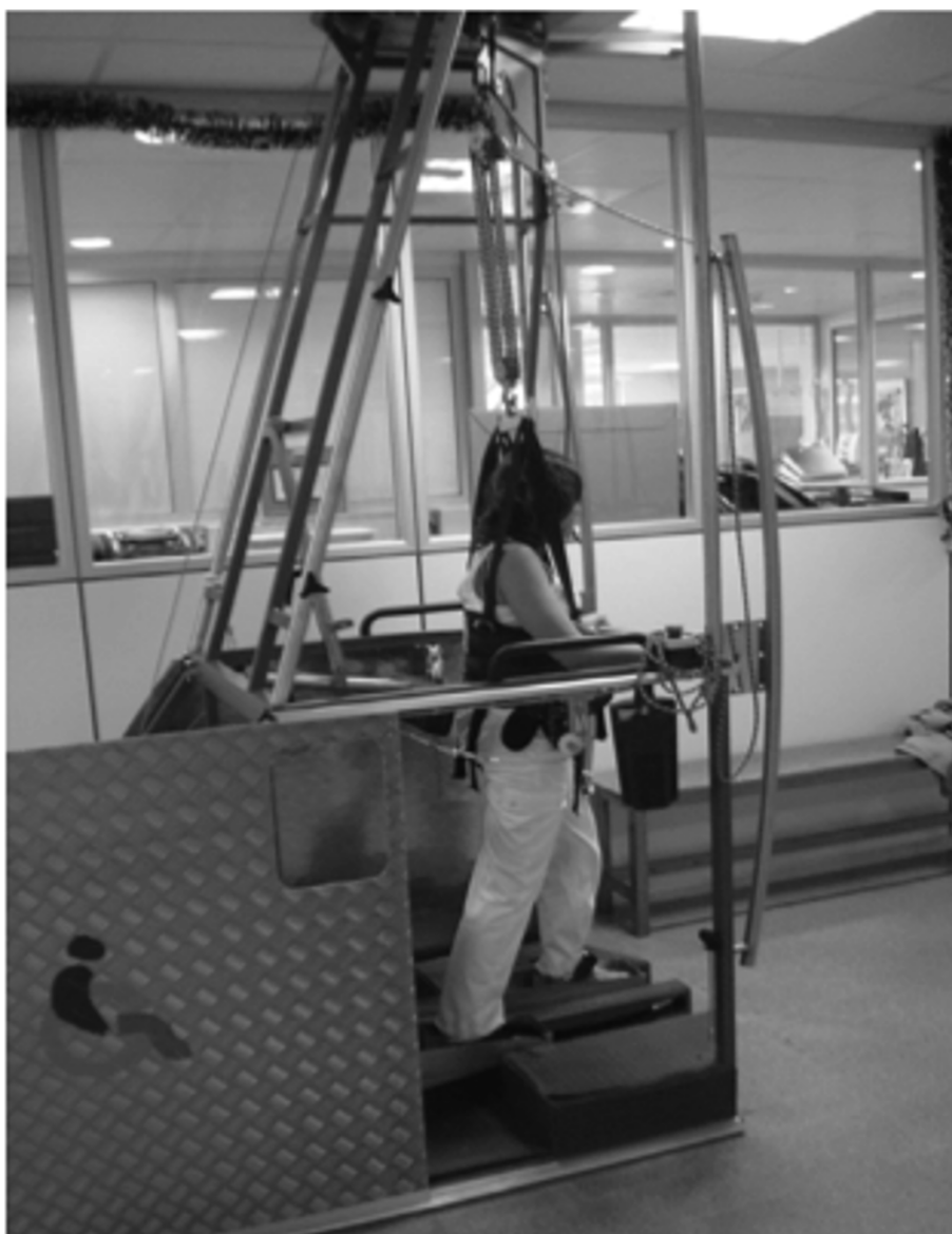
Figure 2 A sub-acute stroke patient during the Robotic Gait training session. During the Body-Weight-Supported-Robotic-Gait Training (BWSRGT) the body weight is slightly unloaded via the use of a harness, while the fixed foot placement on the device ensures a set pattern that mimics human gait with alternate stance and swing phase.

very poor balance and 16 good control of the equilibrium.