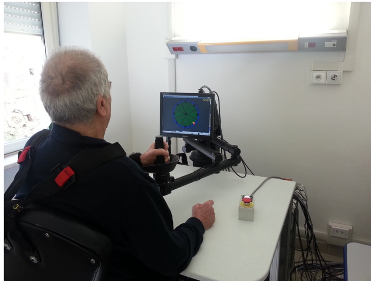
Figure 1 Experimental setup.

assessors at the beginning (T0), after 15 sessions (T1), and at the end of the treatment, after 30 sessions (T2).