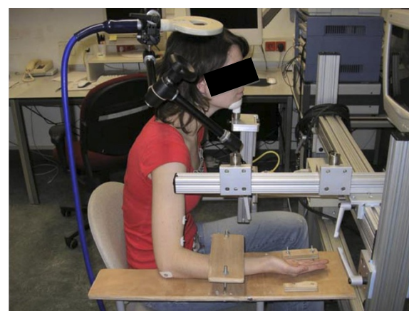
Figure 1 Position of the participant in a chair with the right arm placed in a fixed frame and a circular coil placed above the vertex. Written informed consent for publication of the image was obtained from the patient.

Participants were comfortably seated in a chair with their right forearm and hand supinated and supported by a custom built device (Figure 1). The elbow was positioned in 90 degrees flexion. The device restricted any movement of the upper arm, forearm, wrist, and fingers. Bipolar EMG-recordings were obtained using 2 pairs of self-adhesive surface electrodes (Ag-AgCl, solid gel, foam electrodes (35 × 22 millimeters)) placed in a standard tendon belly montage. EMG-signals were recorded using a CED (Cambridge Electronic Design Ltd) data acquisition and amplifier system with a bandpass filter of 20 to 3000 Hz at a display sensitivity of 0.5 microvolt/division (amplifier range 100 millivolt), using a recording