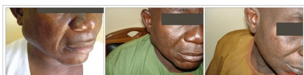
Figure 4 Parotid Gland Enlargement Patient on: Tenofovir/Emtricitabine + Efavirenz