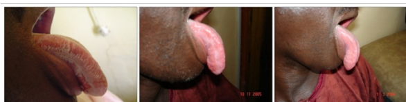
Figure 3 Oral Hairy Leukoplakia Patient on: Tenofovir/Emtricitabine + Nevirapine

The re-occurrence of a new lesion of pseudomembranous candidiasis 4 months after the resolution of the same in a female patient may be an evidence of immune reconstitution inflammatory syndrome (IRIS). 'An IRIS event is defined as either a first presentation or a paradoxical worsening of a pre-existing condition after the initiation of HAART in the presence of rising CD4 counts and falling HIV-1 RNA levels, if measured' [14]. The CD4 counts (cells/ml) of this patient rose from 73 to 269 while