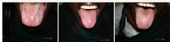
Figure 5 Melanotic Hyperpigmentation Patient on: Tenofovir/Emtricitabine + Efavirenz