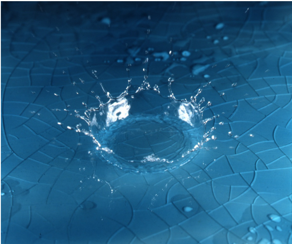
Figure 2 Water drop impact on a solid surface.

numbers [15]. According to these authors the number of branches is given by: