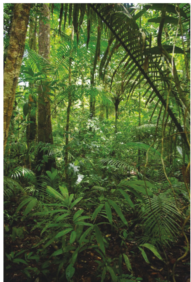
Figure 2 Example of an understory lowland tropical rain forest in the Parque Nacional do Amazonia (near Itaituba, Pará state, Brazil) dominated by palms. Foreground Bactris acanthocarpa var. exscapa , upper right corner Attalea sp., middle left Euterpe precatoria , background: Astrocaryum gynacanthum .