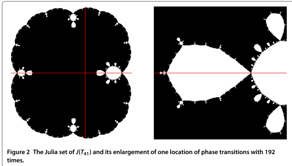
Figure 2 The Julia set of J(T_{41}) and its enlargement of one location of phase transitions with 192 times.