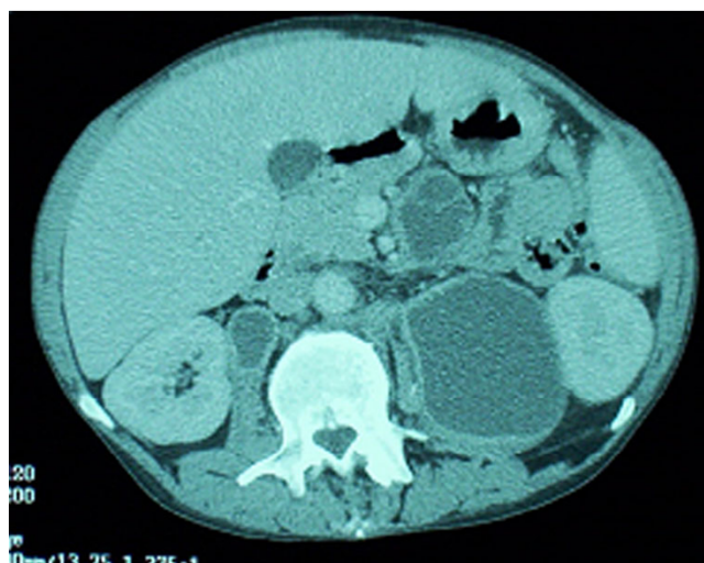
Figure 1 Abdominal CT demonstrating multiple abscessed intra-abdominal lymph nodes.