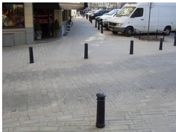
Figure 2 An even sidewalk with bollards separating it from traffic.

neighborhoods and cul-de-sacs, because they are safer and less noisy. In this respect, participants also complained about car drivers using shortcuts causing traffic to be busy in small and normally quiet streets.