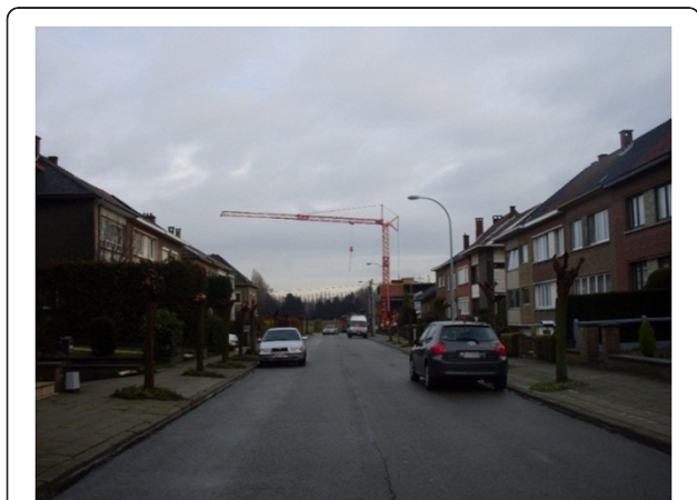
Figure 6 A street with an open view that is getting filled with buildings.

Our finding that good access to facilities (i.e. shops and services) encourages walking for transportation supports results from previous qualitative [20,22,23,25] and quantitative studies [35,40,41]. Findings from the current study suggest that convenience (short distances) might not be the only explanation why the presence of facilities promotes walking for transportation. The presence of other people in shops and shopping streets might as well evoke feelings of safety from crime and provide opportunities for social contacts. Furthermore, our participants enjoyed looking at the show windows of shops. When designing new neighborhoods or senior housing, planners should foresee facilities within walkable distances from the residences. Integrating shops and services into existing neighborhoods might be more difficult to establish. However, the disappearance of local shops and services should be avoided as this might negatively affect walking for transportation among older adults.