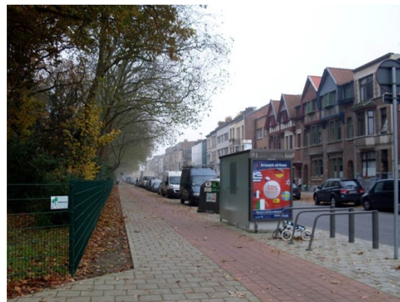
Figure 5 A street with a park on the one side and old, beautiful houses on the other side.

Next to the presence of vegetation, the presence of animals (e.g. birds, sheep, squirrels. . .) was considered pleasant as well.