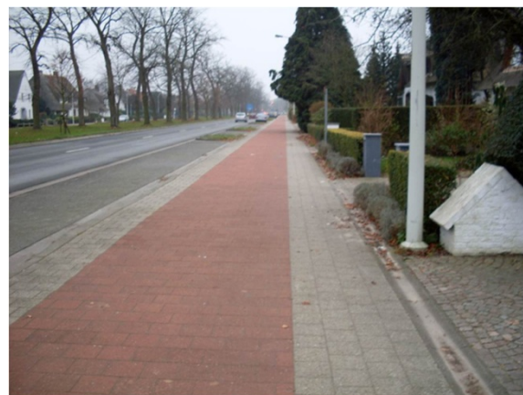
Figure 3 Red tiles clearly marking the cycling path.

Behavior of other road users Some participants expressed safety concerns related to the behaviors of other road users. Participants liked streets with slow traffic and disliked streets with speeding cars. This topic was mostly discussed near street crossings, especially when approaching cars were not visible (e.g. near sharp turns). Participants proposed solutions like speed bumps and chicanes to slow down traffic. On the other hand, participants also mentioned car drivers being very courteous and giving priority to pedestrians at crossings.