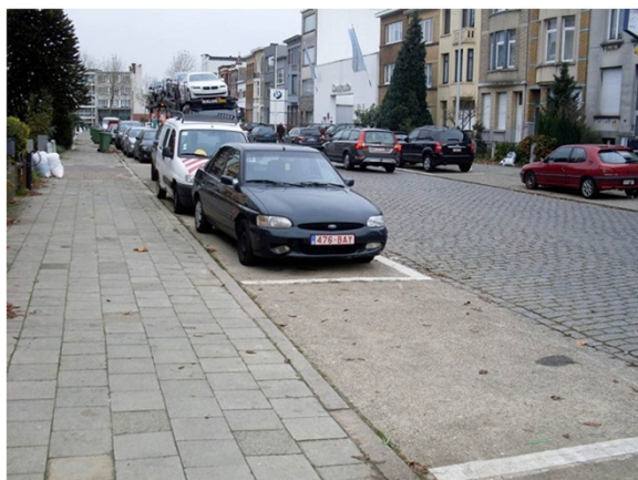
Figure 4 A sidewalk often used by careless cyclists.

from crime and therefore their walking experience. After dark participants disliked and avoided walking in abandoned streets, they liked the presence of other persons. A 75-year-old man talked about walking around in the city center during the evening: