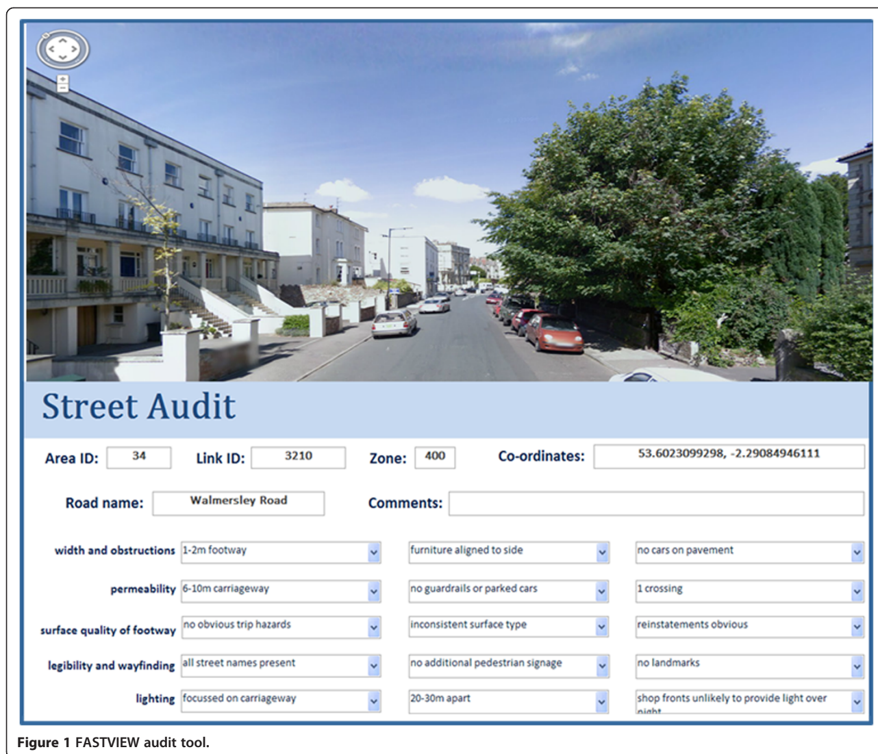
Figure 1 FASTVIEW audit tool.

levels of observed agreement dependent upon the prevalence of agreement [16]. Thus results here report and discuss the percentage of observed agreement in conjunction with the calculated kappa co-efficient. Kappa values were interpreted as follows: 0.01-0.20 (slight agreement); 0.21-0.40 (fair agreement); 0.41-0.60 (moderate agreement); 0.61-0.80 (substantial agreement); 0.81-0.99 (almost perfect agreement) [16]. Three reliability tests were conducted: inter-rater, intra-rater and criterion reliability.