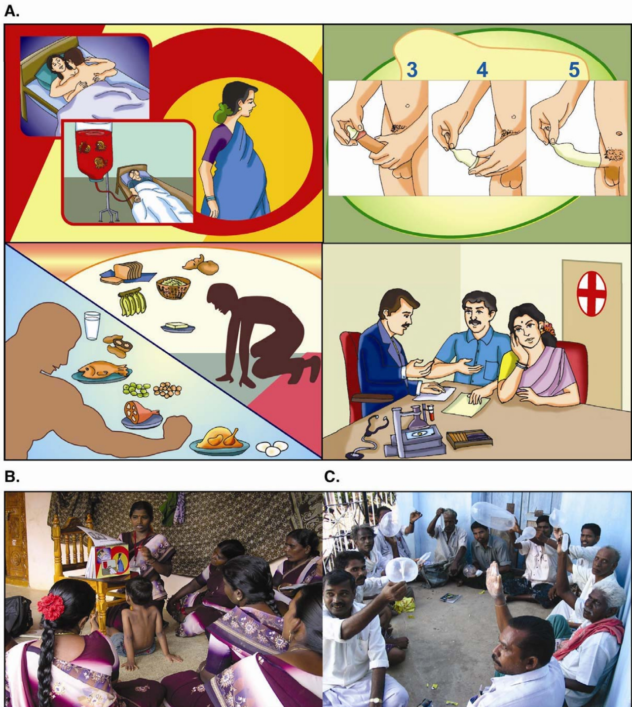
Figure 2 PEPP activities: IEC development, training and outreach activities to educate low-literacy populations. A. To educate low-literacy populations and encourage dialogue, cartoons were developed with simple information on HIV transmission, prevention, support and care. The cartoons were used to prepare flipcharts (with Tamil and English text on the backside) [20], small booklets and one-page pamphlets to distribute to the public. B. A trained female Peer Health Educator uses the flipcharts to educate a women's self-help group on HIV and AIDS. C. As part of their training, barbers do games to overcome their stigma and fear about condoms.