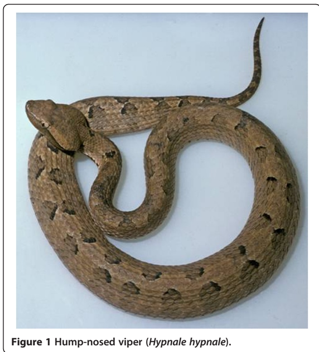
Figure 1 Hump-nosed viper ( Hypnale hypnale ).

with the onset of acute kidney injury, which indicated that active venom was present in substantial amounts to damage his kidneys. Elevated D-dimer in our patient is compatible with increased activation of the procoagulant and fibrinolytic mechanisms. In our patient pre existing atherosclerosis might act as a predisposing factor in the mechanism of H.hypnale venom induced thrombotic occlusion.