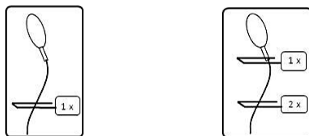
(a) Single touch sperm immobilization (STIm) (b) Triple touch sperm immobilization (TTIm)

Figure 1 Sperm immobilization. (a) Standard procedure STIm: pressing the tip of the tail against the lid of the dish with a microinjection pipette until a clear small bend in the middle of the flagellum is visible (b) More aggressive procedure TTIm: based on application of the standard procedure twice and compression of the sperm mid-piece once.