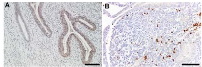
Figure 2 Immunohistochemical localization of the WAP proteins, SLPI and elafin, in human endometrium. (A) , SLPI immunolocalization in endometrium from the mid secretory phase. Immunoreactivity is present in the glandular epithelium and secretions. (B) , Elafin immunolocalization in menstrual endometrium. Immunoreactivity is present in neutrophils infiltrating the endometrial stroma. Scale bars = 100 \mu m.

The WAP protein, SLPI, has also been detected in the endometrial epithelium with peak expression in the mid-late secretory phase (Figure 2a) [39]. This protein may have important actions during the window of implantation. SLPI has several anti-inflammatory actions including inhibition of the proinflammatory transcription factor, nuclear factor \kappa B [40], and this combined with its anti-protease activity may prevent an excessive inflammatory response from occurring in the uterus at the time of implantation and during early pregnancy. In addition, SLPI has recently been suggested to have an effect on epithelial growth. Proepithelin (PEPI) is an epithelial growth factor that can be converted to a growth inhibitor, epithelin (EPI), by elastase. SLPI can form a complex with PEPI preventing its cleavage by elastase and hence, promote