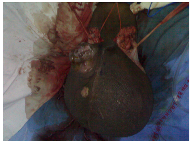
Figure 4 Radical resection of tumour.

The paucity of literature in this area often makes treatment decisions difficult. Simple excision proved to