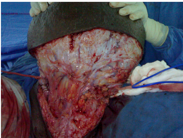
Figure 5 Radical resection of tumour.

be inadequate treatment for sarcomas in the paratesticular region. In the Princess Margaret Hospital report, wide excision revealed microscopic residual disease in 27% of completely excised cases [9]. The primary treatment of LMS of scrotum is complete resection with histological negative margins. The difficulty in achieving an oncological safe margin reflects the tumour biology. An aggressive initial resection is required at the time of the first operation [10]. Many surgical methods have been described for scrotal and penile reconstruction. Like pedicle groin flap based on superficial circumflex iliac artery to cover the penis and bilateral superior medial thigh flap for scrotal reconstruction [11]. We preferred a single staged, simpler reconstruction by using rotation advancement flap of the supra pubic area over the two staged pedicle groin flap to reconstruct the penis. The scrotal defect was primarily closed. For most patients,