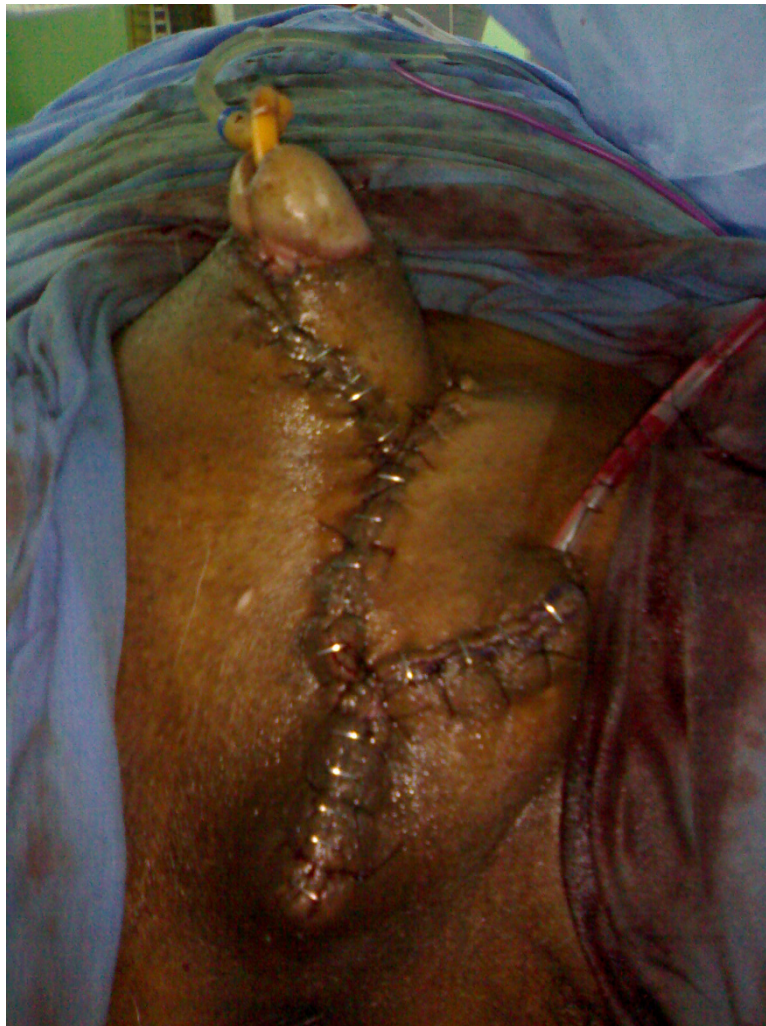
Figure 6 Reconstruction of degloved penis done with suprapubic fasciocutaneous flap.

be inadequate treatment for sarcomas in the paratesticular region. In the Princess Margaret Hospital report, wide excision revealed microscopic residual disease in 27% of completely excised cases [9]. The primary treatment of LMS of scrotum is complete resection with histological negative margins. The difficulty in achieving an oncological safe margin reflects the tumour biology. An aggressive initial resection is required at the time of the first operation [10]. Many surgical methods have been described for scrotal and penile reconstruction. Like pedicle groin flap based on superficial circumflex iliac artery to cover the penis and bilateral superior medial thigh flap for scrotal reconstruction [11]. We preferred a single staged, simpler reconstruction by using rotation advancement flap of the supra pubic area over the two staged pedicle groin flap to reconstruct the penis. The scrotal defect was primarily closed. For most patients,