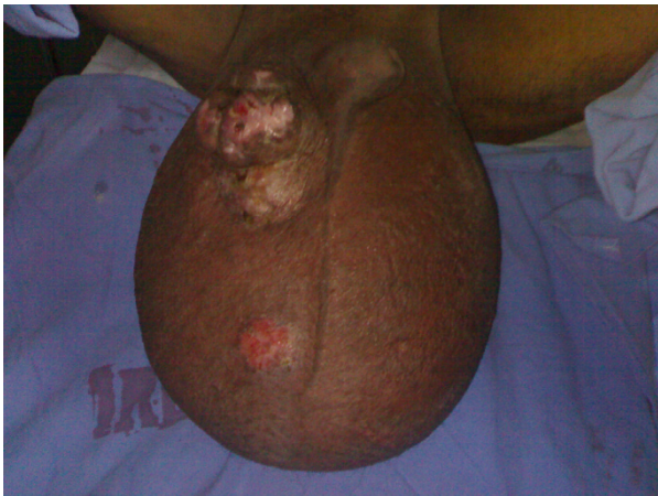
Figure 1 Large 30x30 cm tumour with overlying ulcer over the right scrotum.

Among genitourinary sarcomas in adults, leiomyosarcomas are the most common type and arises in the bladder, kidney, or prostate. Its origin in scrotum is exceptional with only 36 cases have been reported in literature. LMS are malignant mesenchymal line neoplasm with size of the tumor varying from 2 to 9 cm, with an average of 5 cm. Biopsy is done to confirm the diagnoses of LMS. A confirmative diagnosis of LMS is based on histological examination. They show spindle cells with cigar shaped nuclei arranged in interweaving fascicles [1]. On Immunohistochemistry they are positive for actin, desmin and CD 34 [4]. The mode of spread is primarily haematogenous to lung, liver, and bone. Prognoses of LMS depend on tumour size, depth, grade and evidence of distant metastases.