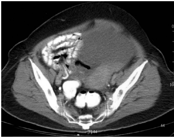
Figure 1 Abdominal computed tomography shows homogeneous cyst on the right side of the pelvis, which was larger than 35 mm in maximal diameter with a solid component.