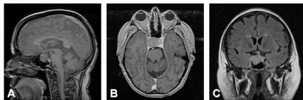
Figure 1 Pre-operative magnetic resonance imaging (MRI) of the head with and without contrast. Prior to endoscopic transnasal resection, midsagittal (A), axial (B) and coronal (C) MRI imaging reveal a homogeneous mass involving the sella turcica with extension into the right cavernous sinus which measures 2.8 cm × 2.1 cm × 1.7 cm. The mass does extend up into the suprasellar cistern, but does not impinge upon the optic apparatus. There is partial encasement of the cavernous internal carotid artery on the right side, but the caliber of the vessel is not compromised.

MRI imaging of the brain was obtained two months following tumor debulking. A persistent mass was noted