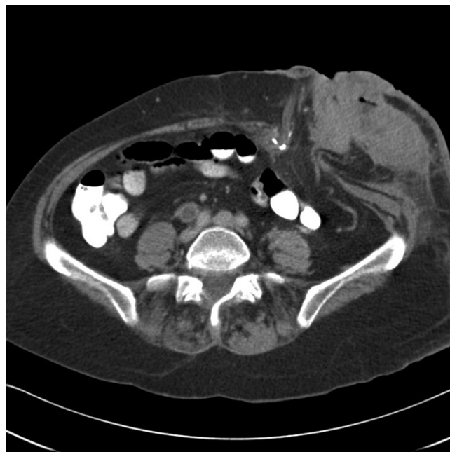
Figure 2 CT scan of the mass, showing abdominal wall metastasis.

Laparotomy was then performed. There was no evidence of any intra-abdominal metastasis and a curative resection of the mass with en bloc completion colectomy was performed (Figure 4). The large 17 × 14 cms defect was covered with V.A.C® (KCI) dressing and an end ileostomy was