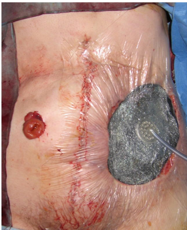
Figure 5 V.A.C® dressing on the open wound.

constructed in the right iliac fossa (figure 5). She made an uneventful post-operative recovery and after 19 days of V.A.C® therapy a meshed split skin graft was harvested from the anterior thigh and used to resurface the abdominal wound.