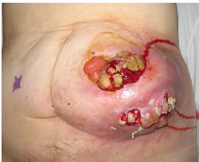
Figure 1 Clinical photograph showing peristomal cutaneous metastasis.

At operation, the mass and the adjacent colostomy were excised wide with generous margins and placed in a bowel bag to avoid any tumour seeding (figure 3). A midline