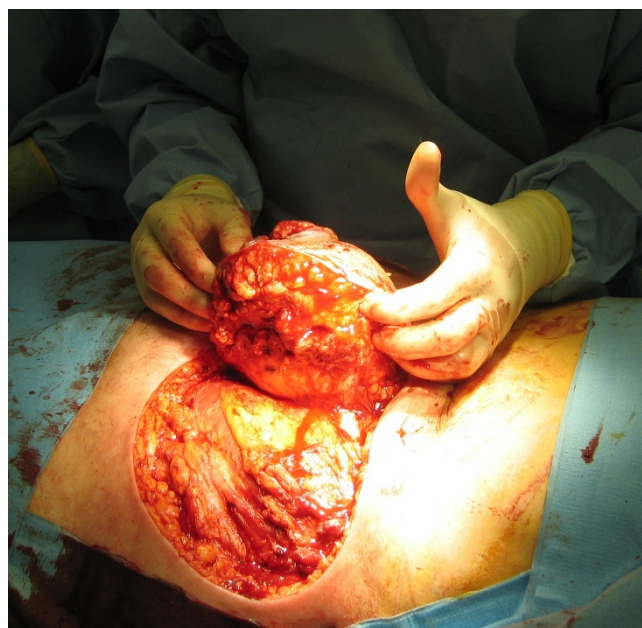
Figure 3 Wide local excision of the mass with the stoma.

Laparotomy was then performed. There was no evidence of any intra-abdominal metastasis and a curative resection of the mass with en bloc completion colectomy was performed (Figure 4). The large 17 × 14 cms defect was covered with V.A.C® (KCI) dressing and an end ileostomy was