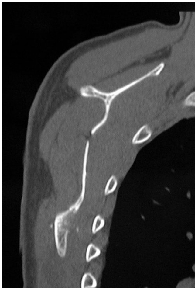
Figure 4 Postoperatively, CT reveals the complete resection the tumor.

In order to safely achieve complete tumor resection through a small incision, the most important factors are the location and the number of the portals. Ruland et al. , [14] described the relation of major neurovascular structures to safe portal sites based upon a cadaveric study. The authors recommended that the portals should be inferior to the spine of the scapula to avoid the neurovascular structure at the superomedial angle. In addition, an area of three to four fingerbreadths from the medial border of the scapula is required to avoid the dorsoscapular nerve and artery. Harper et al. , [6] applied the method of Ruland [14] to treat one case of an osteochondroma located at the superomedial angle. On the other hand, in the case of Kumar [5], the portal was made at the lateral aspect of the scapula and through the axillar region to treat the osteochondroma at the superomedial angle. A portal by the lateral approach has the advantage of not being in close proximity to major neurovascular structures. In addition, only one muscle, the teres major, needs to be partially sectioned. In the present case, the tumor was located inferior to the spine of the scapula. Only one lateral portal was