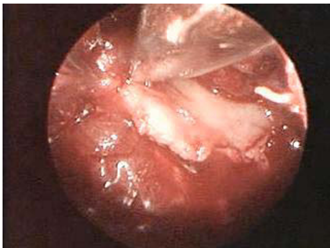
Figure 3 Endoscopic image shows that the tumor was removed by use of a grasper.

case of a chondroblastoma of the femoral head in 1995 [12,13]. Of osteochondromas, only one in the distal femur [7] and only 2 in the scapula have been reported [5,6]. The authors emphasized the superiority of endoscopically assisted tumor resection to the traditional surgical treatment [5-7]. By the use of endoscopy, the size of the incision, the amount of sacrificed soft tissue, and the blind areas can be efficiently reduced. Thus, the entire tumor resection is achieved even through a small incision. Consequently, the patient can obtain an early functional recovery and a cosmetic advantage.