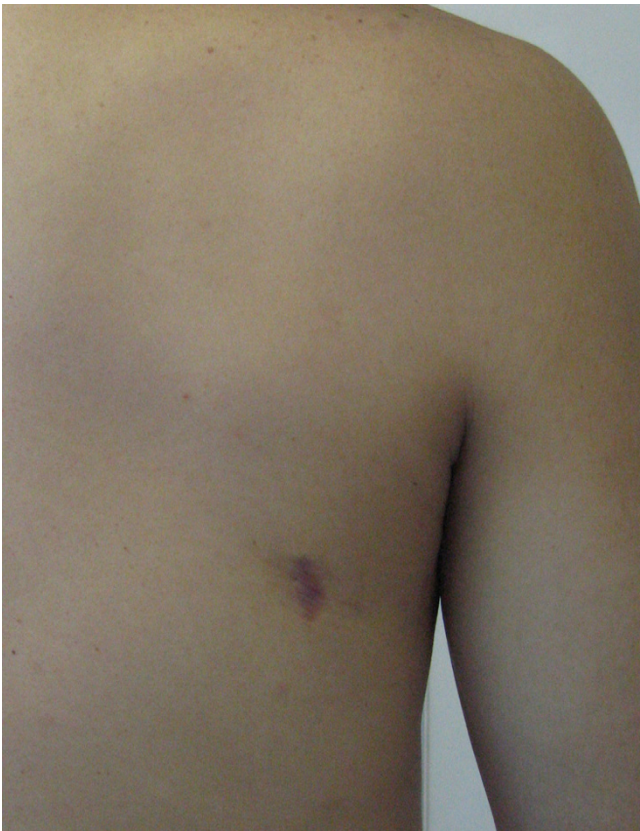
Figure 6 The small scar, 2 cm in length, can be seen in the lateral aspect of the right scapula.