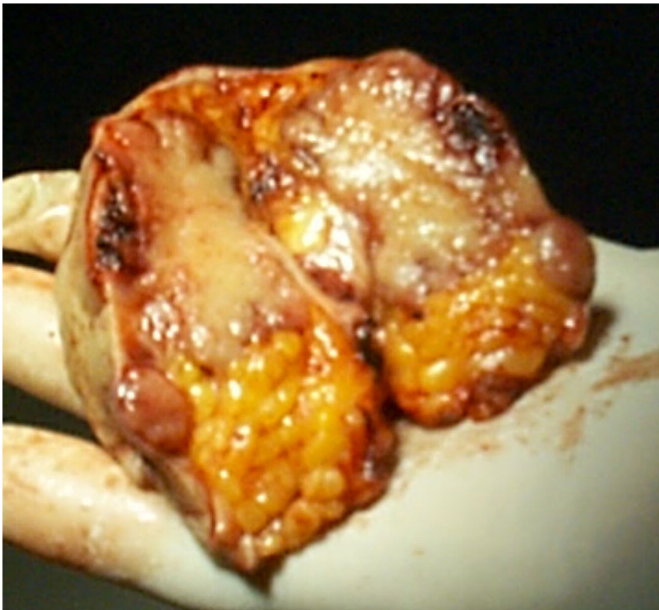
Figure 2 Intraoperative specimen of the umbilical region: Sister Mary Joseph's nodule and umbilicus.

further tumor extension and expansion, tacrolimus was reduced from 6 mg/day to 1.5 mg/day. In addition, chemotherapy with Taxol was initiated (50 mg/m 2 I.V) once a week for 16 weeks. To date, after 6 months of follow-up, the patient is doing well, the liver function is normal and tacrolimus serum level is 1 ng/ml. A recent whole body CT-scan showed regression of iliac and inguinal lymph nodes involvement.