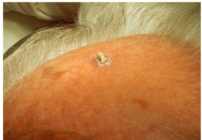
Figure 3 Cornu cutaneum due to solar keratosis of the scalp.

cell tumor, sebaceous carcinoma or Kaposi's sarcoma). Most commonly, they are single and arise from a seborrheic keratosis lesion [8]. Largest study of 643 cutaneous horns was reported by Yu et al [6]. According to them 39% of cutaneous horns were derived from malignant or premalignant epidermal lesions, and 61% from benign lesions. Two other larger studies on cutaneous horn too showed 23–37% of these to be associated with actinic keratosis or Bowen's disease and another 16–20% with malignant lesions [3,9]. In the study of Bart et al [10] 44% patients had underlying malignancy. Three of their patients had past history of skin cancers [10]. Spira and Rabonovitz concluded that cutaneous horns in associated with a malignant or premalignant base is more common in patients with a past history of other malignant or premalignant lesions [11]. In our part of the country exposure to the sun is most common. Majority of the population is involved in farm activity mostly without sun protection. We believe that sun exposure is the most