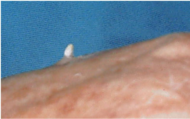
Figure 4 Cornu cutaneum on the hand due to keratoacanthoma.