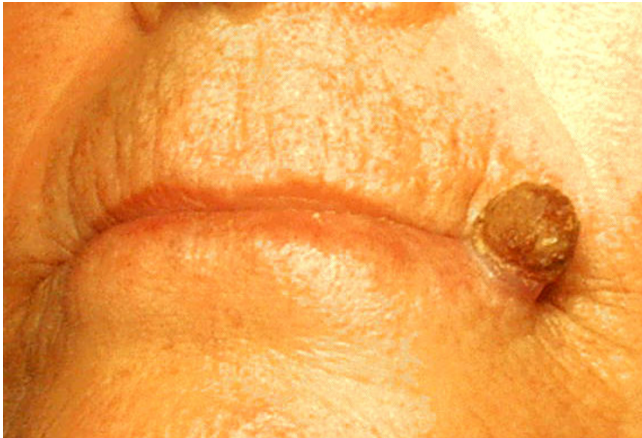
Figure 5 Cornu cutaneum on the lip due to actinic keratosis.

important etiological factor in pathogenesis of the cornu cutaneum like other skin lesions. Histopathological examination of the base of the lesion is necessary to rule out associated carcinoma, and full excision is the treatment of choice. In general, malignant or premalignant conditions are more common in older male patients, especially when the cutaneous horn is found on the face, pinna, dorsum of hands, forearms, or scalp, or when it has a larger base or base-height ratio [3]. Surgical excision remains the treatment of choice.