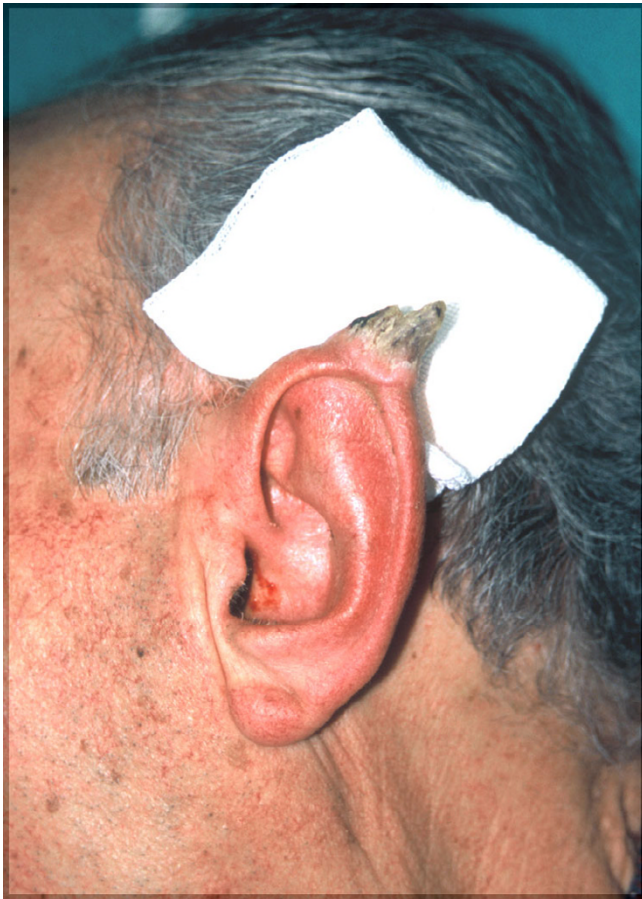
Figure 1 Cornu cutaneum on the left ear. Histologically lesion was reported as actinic keratosis.