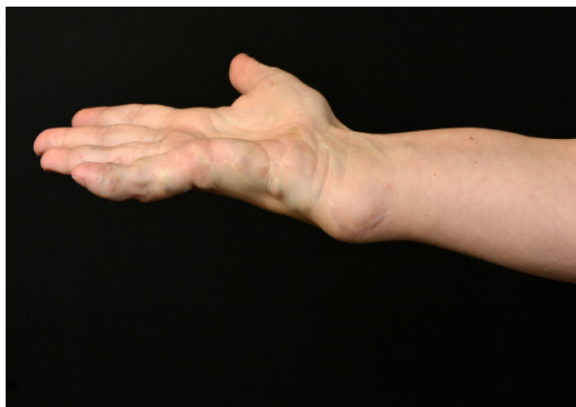
Figure 1 Right wrist with a large hemangioma and a few smaller ones on the metacarpophalangeal joint, and multiple scars after resection of relapsing hemangiomas.

Possible surgical complications could be divided into intracranial, orbital and local complications. Local complications include anosmia, bleeding and septal abscess. Intracranial complications include rhinoliquorrhoea leading to meningitis, encephalitis or intracranial abscesses. Possible orbital complications include double vision resulting from motility dysfunction, loss of vision, and