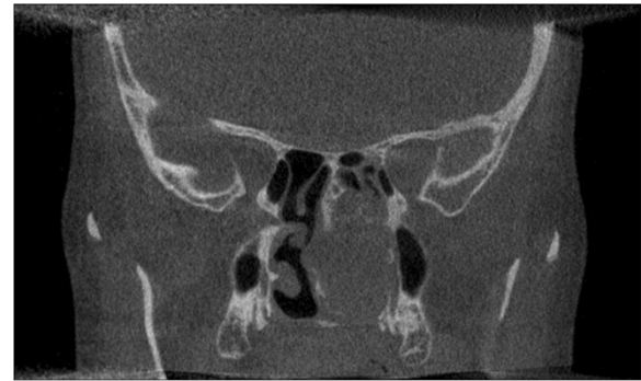
Figure 2 Coronal non-contrasted computed tomography scan of the skull, showing a tumorous lesion in the left nasal cavity extending 3.7 \times 3.2 \times 2.6 cm in diameter with partial infiltration of the surrounding structures.

orbital infections or intraorbital hematoma. Postoperatively, none of these complications was noted.