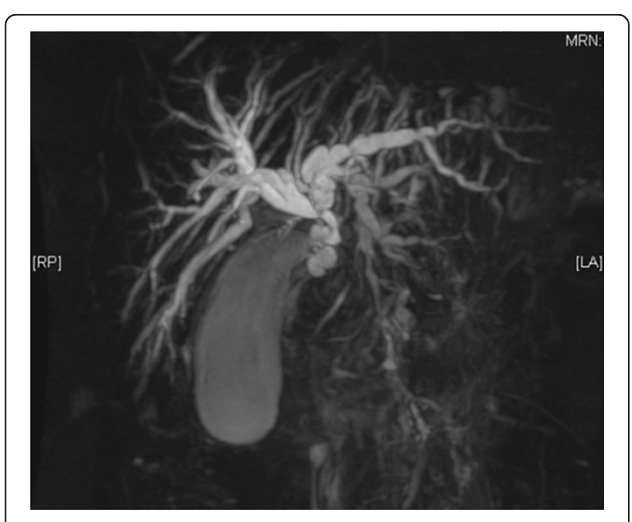
Figure 1 Magnetic resonance imaging showing the stenosis of the middle portion of the common bile duct and the dilatation of intra- and extra-hepatic biliary tree.

In the patient's past medical history there was a right radical mastectomy with axillary lymph node dissection for breast cancer performed 13 years earlier. At that time there was no evidence of distant metastasis. Pathology of