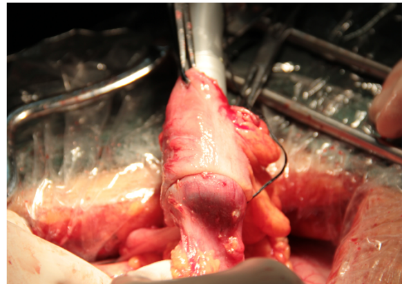
Figure 1 End-to-side anastomosis: withdrawal of circular stapler.

For the FEEA maneuver, small holes were made in the walls of the ileum and the colon using an electric scalpel. The prongs of the linear stapler (Proximate, TLC75 or TLC10; Ethicon Endo-Surgery, Cincinnati, Ohio) were inserted in these holes and were fired to perform the anastomosis (Figure 3). We waited for 30 s before releasing the stapler to allow for hemostasis. The mucosal