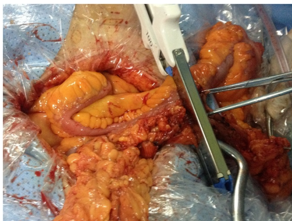
Figure 4 Functional end-to-end anastomosis: resection of ileocecal site using stapler.

Data presented as mean ± standard deviation or n (%). TNM, 'tumor, node, metastases'.