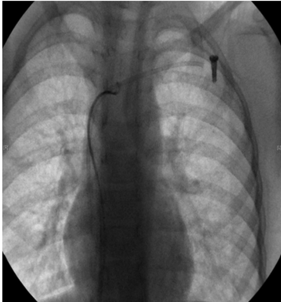
Figure 1 Chest radiogram in case 7 showing the port-A catheter broken at the site of anastomosis to the port. The loop of the gooseneck snare has caught the dislodged catheter.

dysfunction, two presented with a cough and the other one was identified incidentally during surgery for removal of his port-A catheter. All dislodged catheters were successfully retrieved without complication by transcatheter retrieval through the femoral route using a gooseneck snare and one with additional pigtail help. We used chi-squared or Fisher's exact tests to compare categorical variables. We used Student's t test to compare continuous variables. A P value less than 0.05 was considered statistically significant.