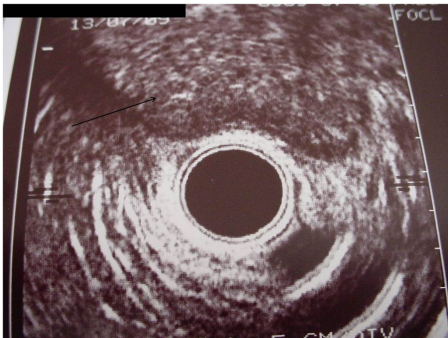
Figure 2 Endoanal ultrasound showing the perineal mass with sphincter involvement (black arrow).

The two modalities of the treatment (including APR or neoadjuvant chemoradiation followed by low rectal resection and local excision of perineal mass with the risk of recurrence and incontinence) were discussed with the