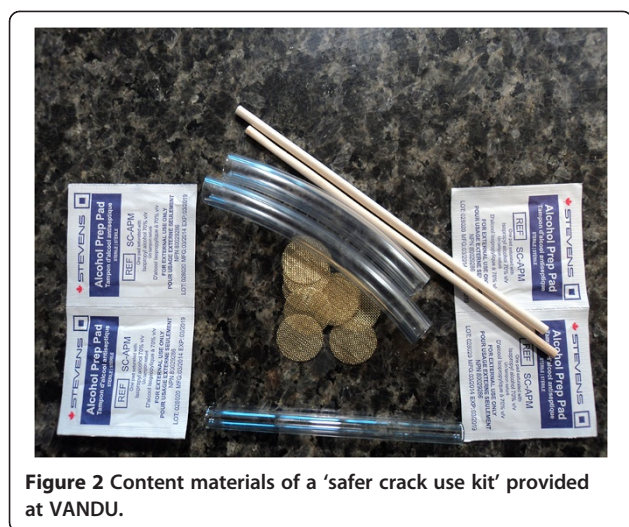
Figure 2 Content materials of a 'safer crack use kit' provided at VANDU.

the NIDU population was adopted based on the behavioral changes related to IDU needle-sharing behavior outside of the SIF in Vancouver. Kerr et al. [24] and Bravo et al. [43] found that IDUs who relied upon SIFs were also able to reduce their needle-sharing activities outside of the facility up to a significant extent. Table 1 provides the estimates and variables used in the model (please note that percentages need to be converted to fractions when imputing the variables in the model).