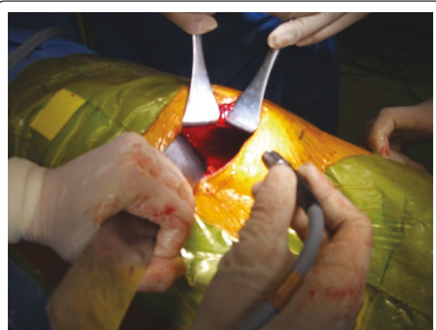
Figure 2 The surgical procedure of the A method (No.2). It is possible to remove the flank pad and to access the retroperitoneal space under one's direct vision.

According to the criteria applied in our hospital for selecting the surgical method for renal cell carcinoma, the main indication for retroperitoneoscopic radical