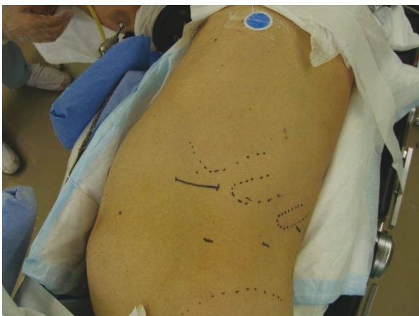
Figure 1 The surgical procedure of the A method (No.1). The patient's position is lateral position and an incision of about 7 cm is made from the top end of the 11 th rib to the border of the rectus abdominis.

The factors in the outcomes compared between the A and B methods were the duration of procedure, volume of bleeding, volume of transfusion, weight of the specimen, incidence of peritoneal injury, rate of conversion to laparotomy, and perioperative complications. The