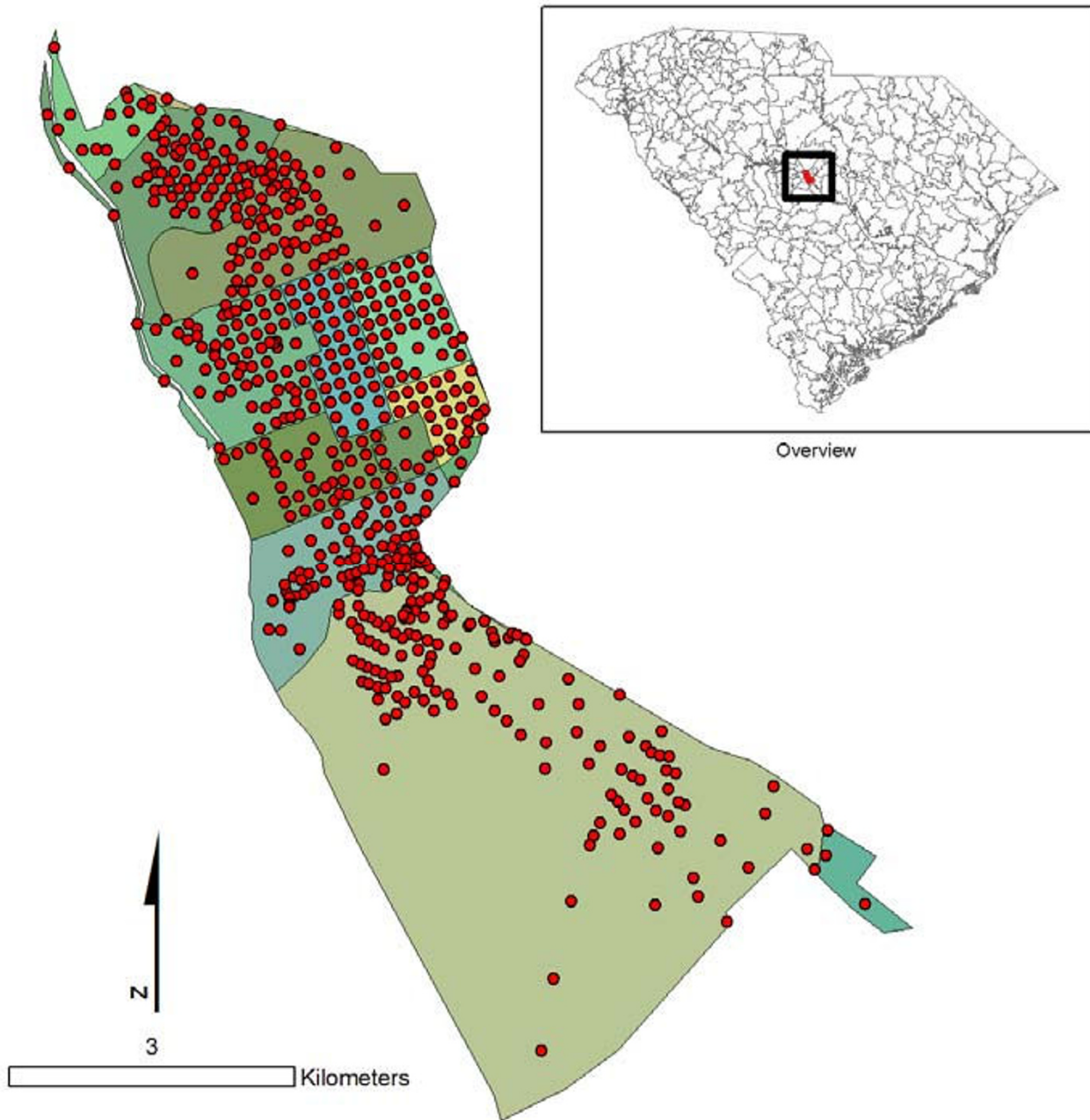
Figure 2 Block centroids and tracts within a ZCTA.