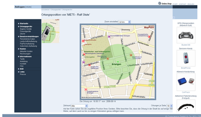
Figure 2 Corscience mobile GPS tracking system. Diagram showing the main components of Corscience mobile GPS tracking system.