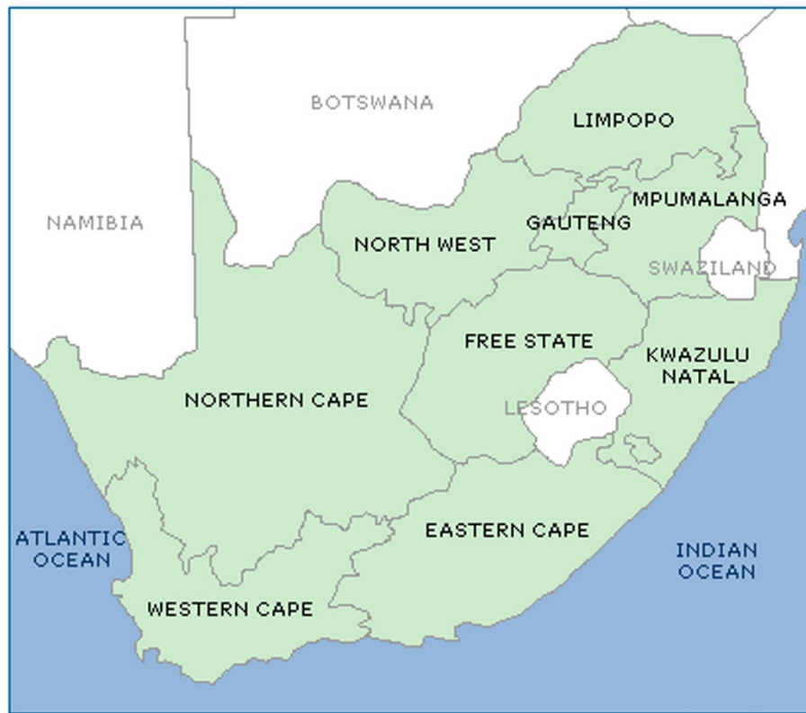
Figure 1 Map of South Africa, with provinces and neighboring countries.

seroprevalence before developing a Bayesian multivariable convolution model.