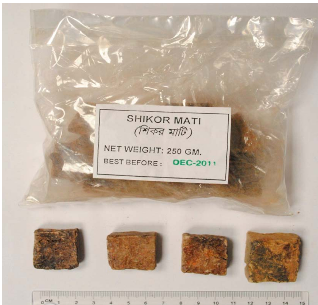
Figure 1 Typical example of Sikor tablets from Bangladesh purchased from shops in the United Kingdom. Shikor Mati can be translated as Sikor soil.

UK). This instrument was fitted with a micro flow concentric nebulizer and quartz Scott-type chamber. Helium ( 4 \text{ L min}^{-1} ) was used for collision cell gas and tellurium ( 50 \mu\text{g L}^{-1} ) was used as internal standard. Solutions were subjected to arsenic speciation analysis using a HPLC (GP50-2 pump, Dionex, USA) coupled to an ICP-MS (Agilent Technologies, UK). The HPLC conditions used were similar to that previously reported [20]. An anion exchange column (Hamilton PRP-X100, 250 \times 4 \text{ mm} , 10 \mu\text{m} ) was used to separate the As species. Ammonium nitrate was used as anion exchange mobile phase at pH 8.65.