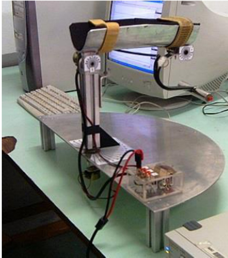
Figure 1 Custom made elbow angle monitoring device.