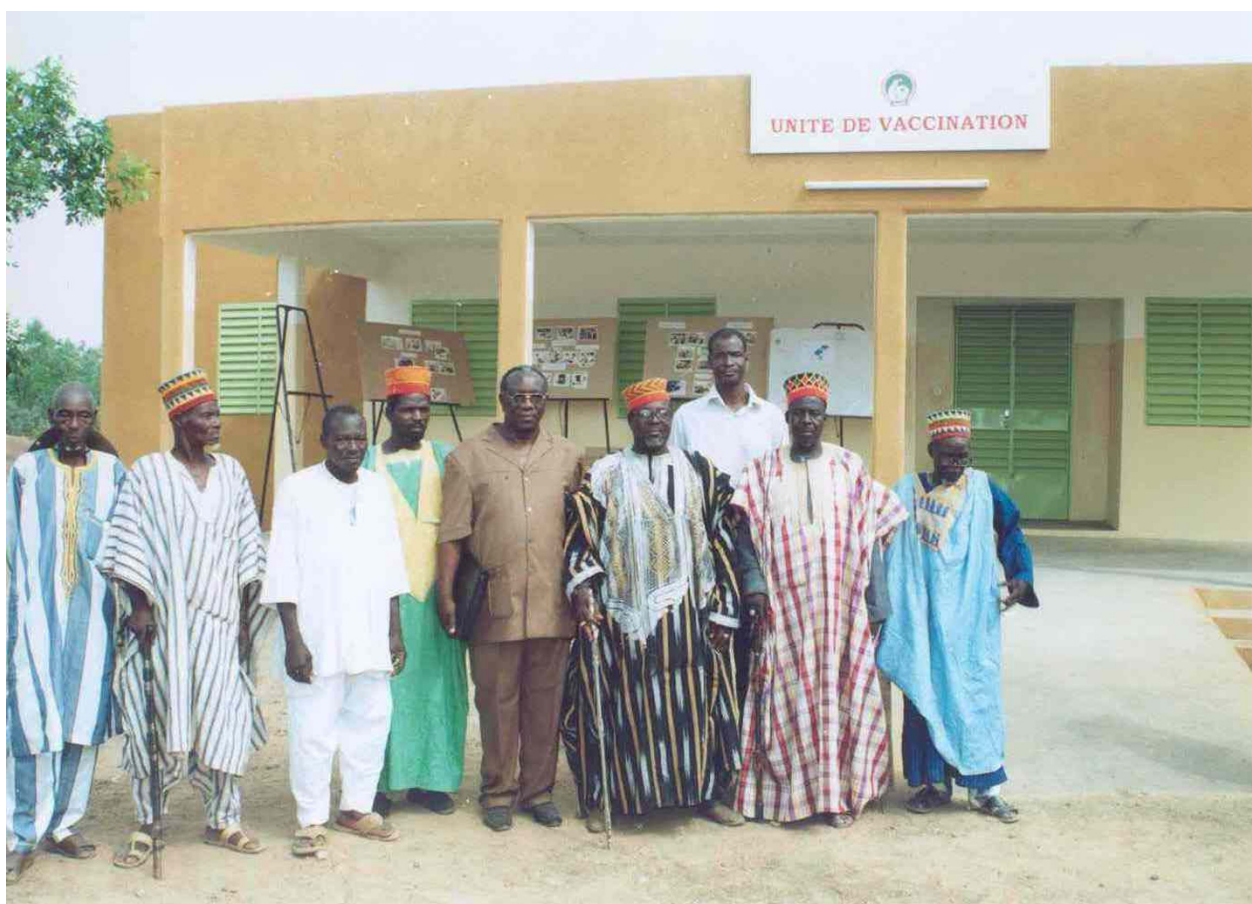
Figure 1 Picture showing the researchers with community leaders after a meeting in Burkina Faso.

30 trial participants. Therefore, the traditional game was successfully used to randomly and fairly select individuals to be screened with everybody attending the community meeting understanding the basis of selection as being equal chance for all the eligible candidates.