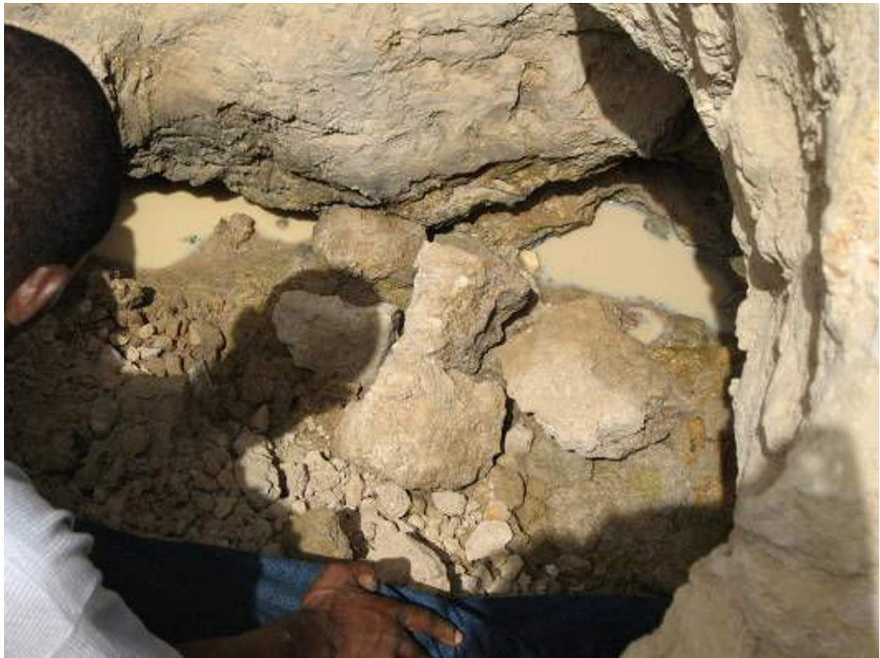
Figure 3 Brick-hole in Zongo district

did not vary significantly between districts. However the M form predominated slightly ( \chi^2 = 6.97 , df = 3 P > 0.05 ). The proportion of each species between April and October 2006 as significantly different ( \chi^2 = 10.23 , df = 2 P < 0.01 ).