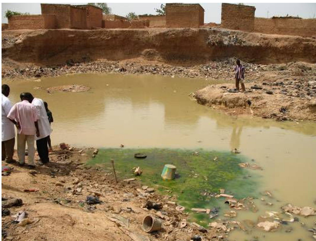
Figure 4 Polluted breeding site in Yamtenga district