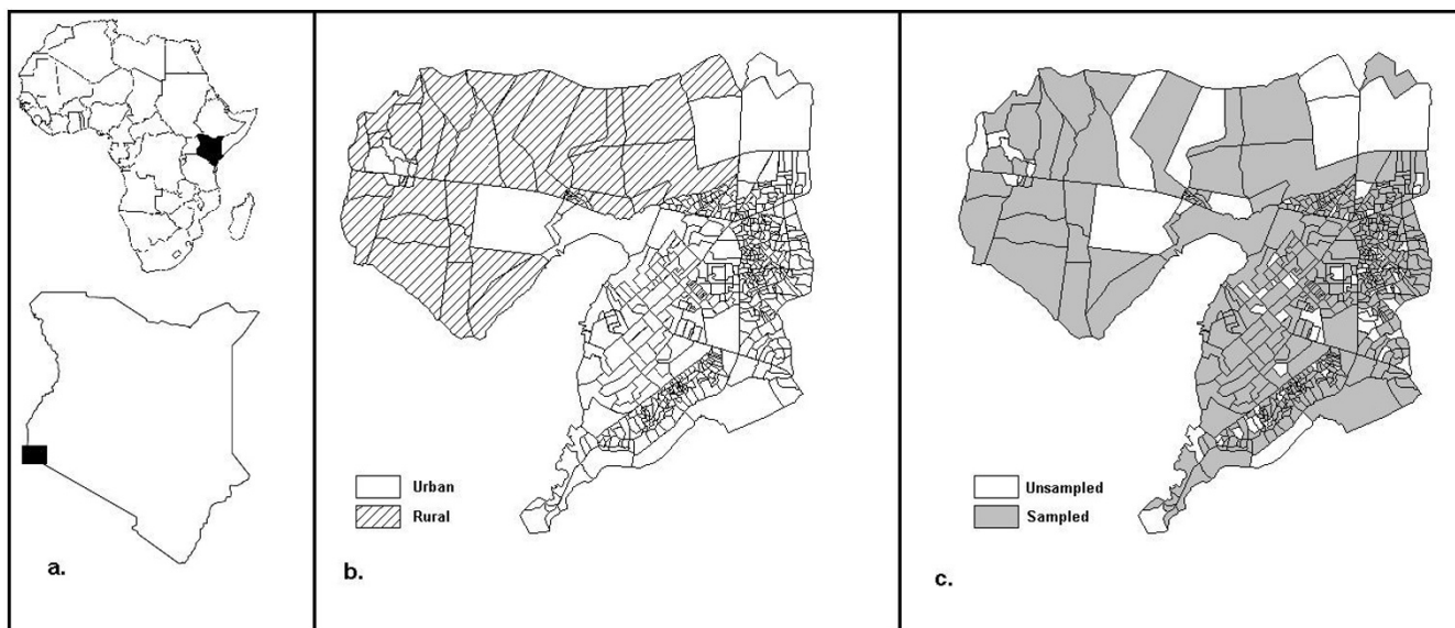
Figure 1 Maps of study area in Kisumu, Kenya. Maps include (a) region of study, (b) urban/rural designation of census enumeration areas (EAs) within study area, and (c) sampled and unsampled EAs.

area, data collection was limited to the 13 administrative sublocations of the city (roughly equivalent to large neighbourhoods) with overall population densities > 1,000/km 2 . This density threshold has been used to define "urban" in a recent review of malaria morbidity and mortality across Africa [26]. At smaller scales, population density within the study area varied considerably. The study area encompassed a range of urban ecotypes with variation in factors likely to influence malaria risk, including land use/land cover, economic and agricultural activity, distance from urban shops and health facilities, and environmental features. The study site comprised 202,282 people in 54,403 households (Table 1) [25], over an area of 62.3 km 2 .