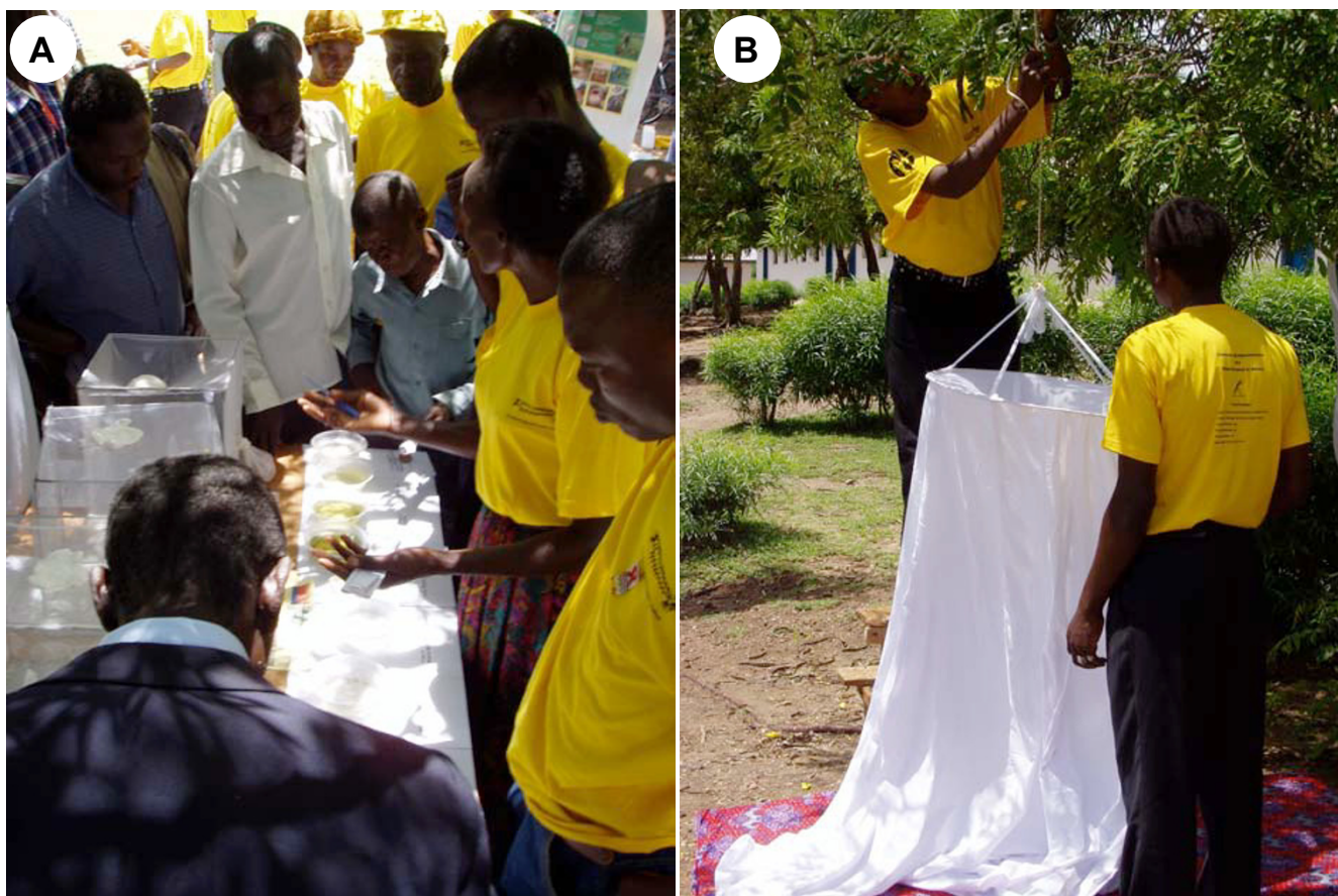
Figure 2 Community members demonstrate the life cycle of mosquitoes (A) and the use of practicable adult mosquito sampling tools (B) at Rusinga Island Child and Family Programme/Christian Children's Fund-Kenya, African Malaria Day, May 2004 on Rusinga Island, Western Kenya.

sustainable changes in behaviour with knowledge transfer from children to adults and between families and friends.