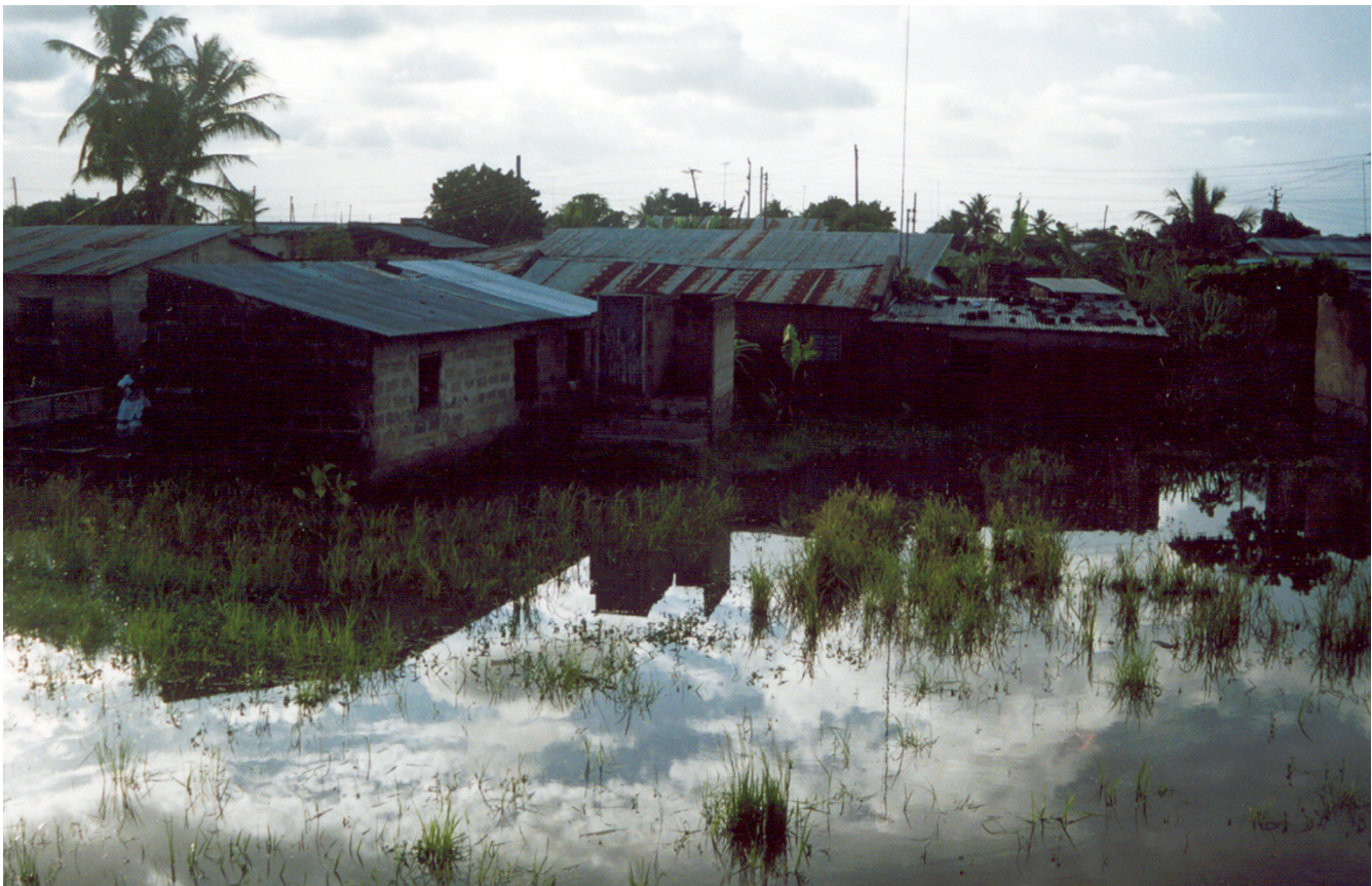
Figure 6 Examples of flooded areas in the poorly planned settlements of Vingunguti in Ilala municipality, Dar es Salaam, Tanzania.

ideal for delivering community-based vector control interventions [15,34,39,87]. This degree of autonomy enabled Ilala Municipal Council to independently conceive, fund and implement a community-based mosquito surveillance programme as an entirely local initiative in early 2002. Supplementing ongoing programmes for social marketing of ITNs and improved access to effective diagnosis and treatment [88], teams of community members were recruited to map and characterize the extensive breeding sites provided by intensive urban agriculture and poorly planned settlement (Figure 6) which abound in Dar es Salaam [76,89] and many other African cities [19,20,90-93]. Weekly surveys for larval and adult mosquitoes were piloted in 7 of the 22 wards of Ilala Municipality as a preliminary step towards IVM by larviciding and environmental management. Furthermore, all three municipal councils had actively promoted a variety of locality-specific community-based environmental management schemes such as trench digging and collection of solid waste refuse to prevent obstruction of such drains (Figure 7). In June 2003 the City Medical Office of Health (CMOH) convened a stakeholders meeting for all con-