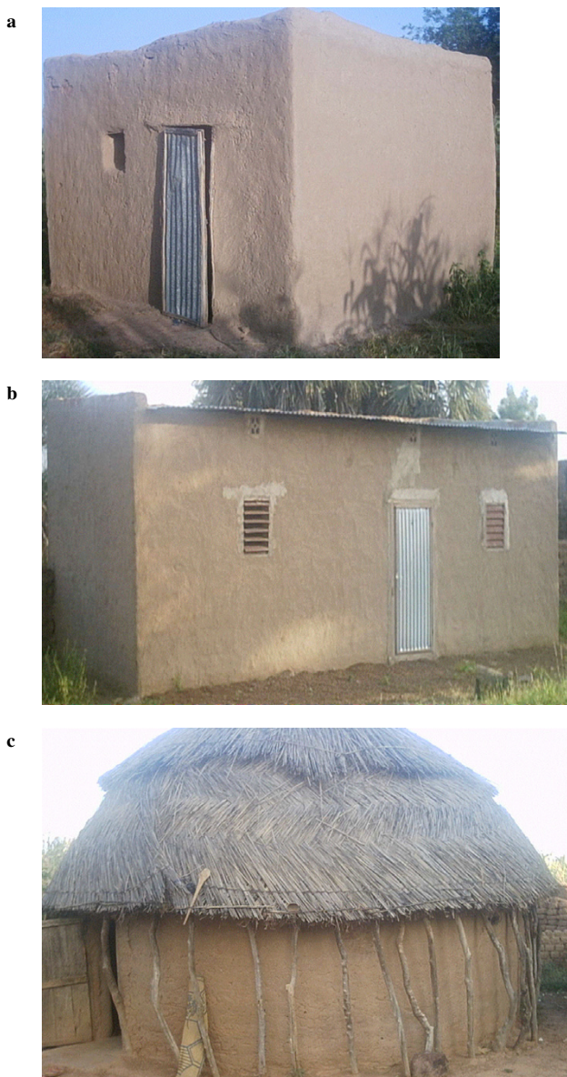
Figure 2 Typical housing in study region; A) mud blocks with mud roof; B) mud blocks with iron sheet roof; C) mud blocks with grass roof.

Parents of selected children were visited prior to the survey to obtain informed consent. The objective and methods of the study were explained to them during these visits. They were also told that the finger prick procedure was very safe with the use of single-use lancets, although it may be slightly painful for the children; that the quantity of blood taken with this method was not harmful for the child; that the child would benefit from a medical check-up for malaria and other common pathology; that