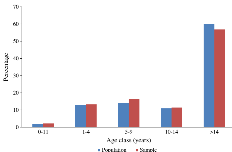
Figure 1 Age-specific distribution of the total and the sampled population.

Logistic regression analysis was carried out by considering SPR (0-negative, 1-positive) as dependent variable and the other study variables, such as age, gender and ecotype, as independent variables. The overall fit of the logistic model was found to be good fit (Hosmer and Lemeshow Test: \chi^2 = 12.68 ; df = 8 ; P = 0.123 ). Individual co-efficient of independent variables was also found to be statistically significant ( P < 0.05 ). The estimated odds ratio (OR) with 95% confidence interval for females was 0.84 (0.76-0.93) indicating that the risk of getting malaria among females is significantly ( P < 0.001 ) less than that of males (OR = 1.0). Similarly the OR for foothill (0.58; 95% CI = 0.5-0.67) and plain areas (0.35; 95% CI = 0.29-0.41) were significantly ( P < 0.001 ) less than that of hilltop villages (OR = 1).