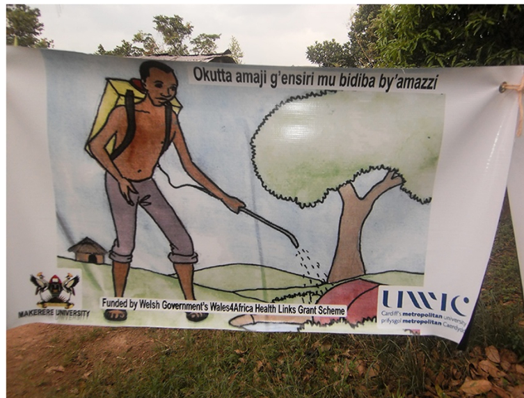
Figure 1 One of the posters used for training community health workers and sensitization.

fliers were distributed to the community after the training so as to give them out to others who did not attend. These materials were translated into the local language ( Luganda ) so as to facilitate learning among the population.