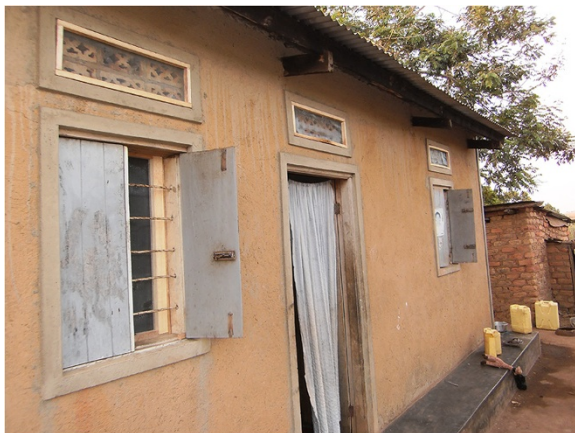
Figure 4 One of the demonstration houses with complete mosquito proofing in windows and ventilators.

the number of household members and the available functional nets at the time. Households received between two and six LLINs. These interventions were carried out after educating the beneficiaries on the importance of using the methods in the prevention of malaria. These demonstration households were important in promoting the integrated approach among the community. The interventions were not only beneficial to the members of the demonstration households but also the entire community who appreciated the integrated approach, which they had been taught during the project training. Indeed, several community members on seeing the demonstration households expressed interest to the project team in having the interventions also implemented in their houses. In addition, villages neighbouring those involved in the project requested the project team to extend the interventions to their areas. However, this was not possible mainly due to limited resources. It was the responsibility of members of