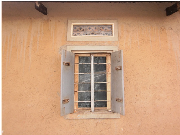
Figure 3 A window and ventilator on one of the demonstration houses with complete mosquito proofing.

the number of household members and the available functional nets at the time. Households received between two and six LLINs. These interventions were carried out after educating the beneficiaries on the importance of using the methods in the prevention of malaria. These demonstration households were important in promoting the integrated approach among the community. The interventions were not only beneficial to the members of the demonstration households but also the entire community who appreciated the integrated approach, which they had been taught during the project training. Indeed, several community members on seeing the demonstration households expressed interest to the project team in having the interventions also implemented in their houses. In addition, villages neighbouring those involved in the project requested the project team to extend the interventions to their areas. However, this was not possible mainly due to limited resources. It was the responsibility of members of