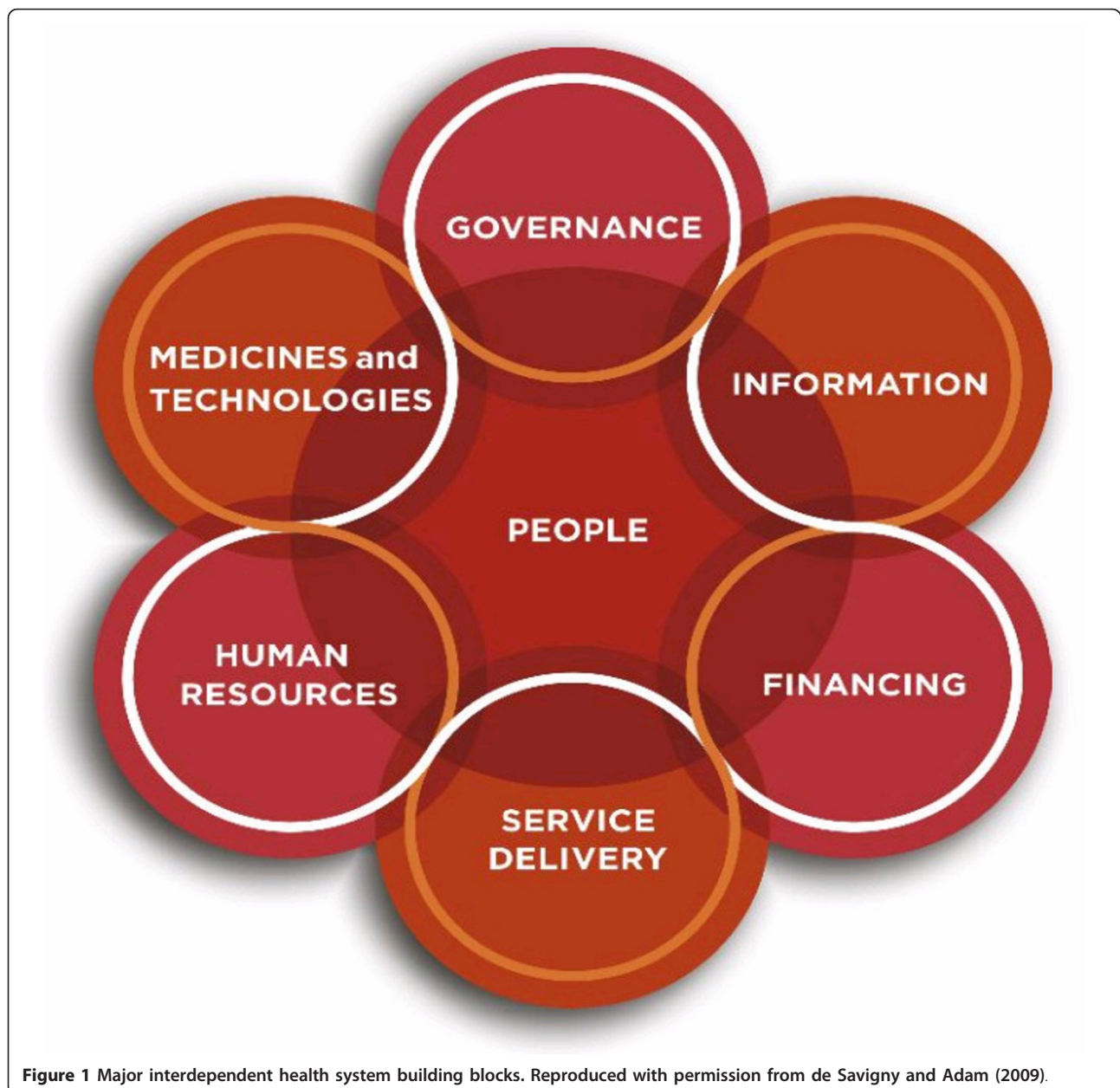
Figure 1 Major interdependent health system building blocks. Reproduced with permission from de Savigny and Adam (2009).

For a governance framework to be of use to a health system steward it should: 1) be indicative of where governance issues are; 2) weight the individual elements composing governance in order to identify major drivers for “strong” or “weak” governance; and 3) provide a systematic way to assess these complexities. Our conceptual framework is based on the WHO (2007) model of the health system, but modified to adopt the systems thinking approach suggested by de Savigny and Adam (2009) where all the areas (or building blocks) intertwine (Figure 1 - Major interdependent health system building blocks).